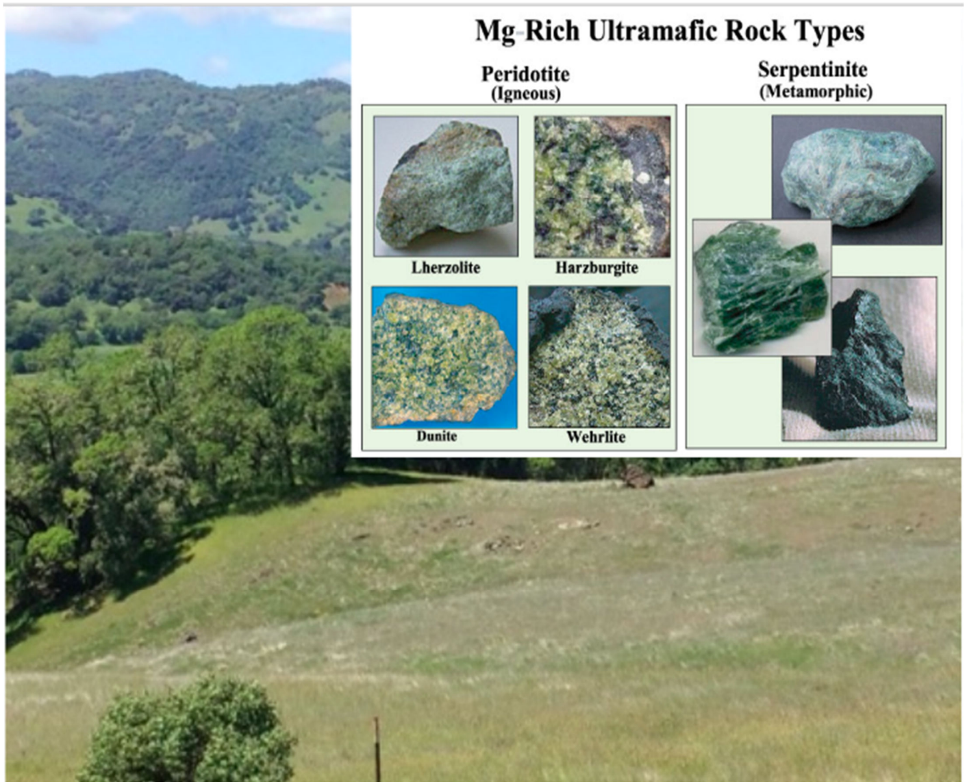
Figure 1-Picture of adjacent nonserpentine and serpentine site at Hopland Research and Extension Center. (Inset) Various rocks comprised of magnesium-ferrous silicate minerals from which serpentine soil is derived. The peridotite rocks are (clockwise) Lherzolite, Harzburgite, Dunite, and Wehrlite.

Soil found at Coyote Ridge, McLaughlin Natural Reserve, Hopland Research and Extension Center and Jasper Ridge Biological Preserve have one thing in common: they were created through the weathering of ultramafic rock which is comprised primarily of magnesium-ferrous silicate minerals (Figure 1, [1,2]). Soil created from ultramafic rocks or serpentine soil is a treasure which facilitates the growth of 13% of the California's endemic plant species although it covers only about 1% of state [3]. Serpentine soil contains high amounts of magnesium, relatively low amounts of essential plant nutrients such as nitrogen, phosphorus, and potassium and elevated concentrations of heavy metals which contribute to