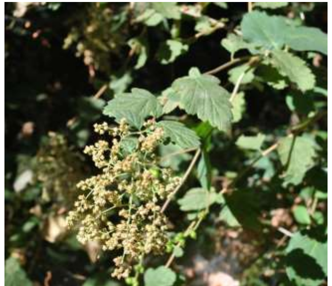
Tom Lee Ocean spray ( Holodiscus discolor ) in Sanborn County Park August 2022.

Enjoy the pristine trails of Sanborn Park on July 14 with Tom Lee. We will hike through a lushly wooded park with redwood and tanbark oak trees. This hike will be about 2 miles long with an elevation gain of 250 feet. The trail starts with an easy climb and continues until we reach Welch House. Then we'll retrace our steps back to the trailhead. The historic Welch-Hurst house was built in 1892 as a gentleman's working ranch and family retreat. In later years it became a hostel until its closure in 2010.