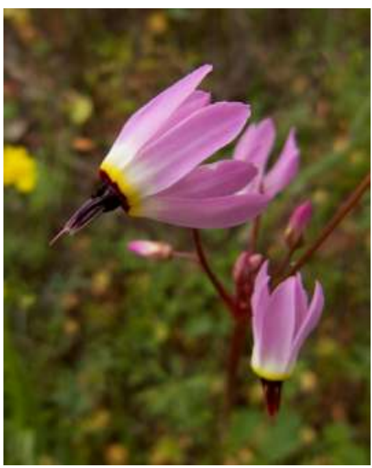
Dee Shea Himes Woodland shooting star, Primula hendersonii Stile Ranch, March 2015

There are no restroom services at the parking area or on the trail, however there is a restroom on McKean Road just across from Fortini Road at Rancho San Vicente Open Space parking area.