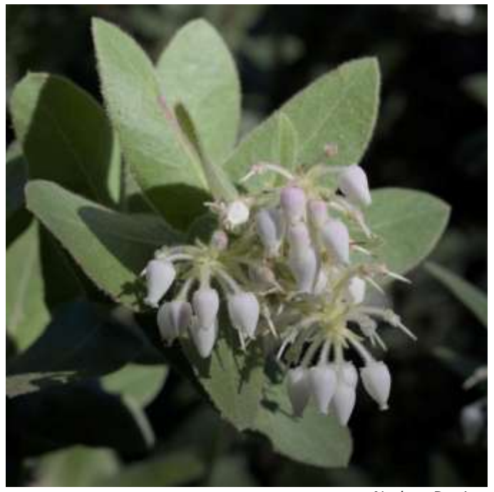
Kings Mountain manzanita, Arctostaphylos regismontana, El Corte De Madera Creek Open Space Preserve, January 2025

I spotted this Arctostaphylos regismontana while hiking in El Corte De Madera Creek OSP this weekend (CRPR 1B.2)*. This was the first time I was able to identify a manzanita from my hiking photos because I've gotten better at capturing the necessary features of the plants for ID.