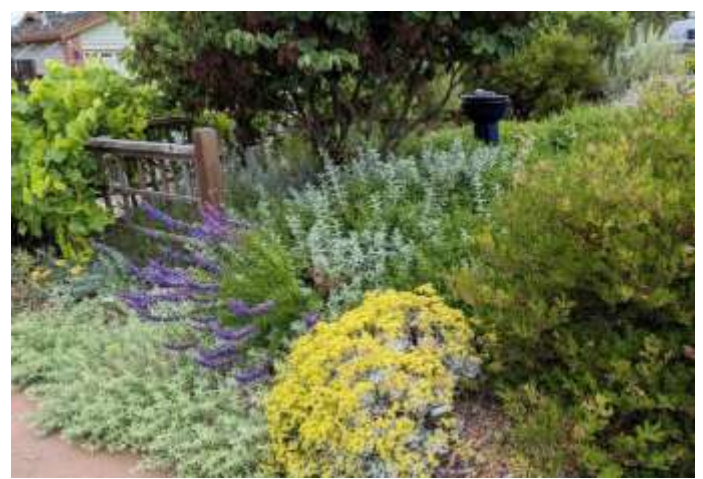
Stephanie Morris Native plant garden design, showing manzanita, woolly bluecurls and saffron buckwheat in spring

program meeting will be Monday, April 14, 7:00 – 8:30pm on Zoom.